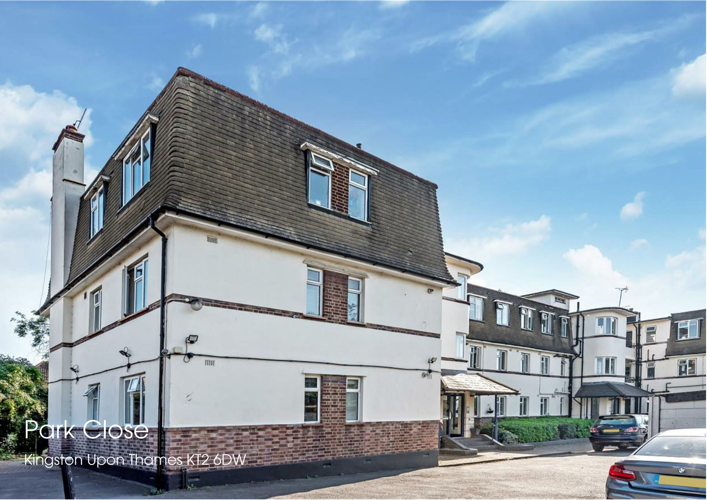
Park Close Kingston Upon Thames KT2 6DW